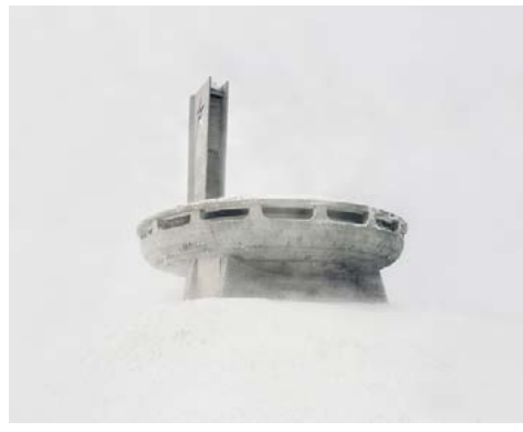
The Buzludzha monument of The Bulgarian Communist Party. 2015 Danila Tkachenko © Courtesy of the artist and Kehrer Gallery