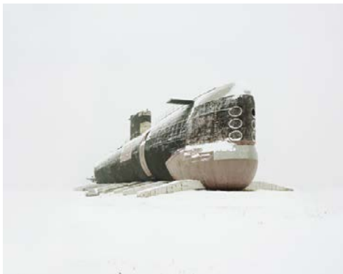
The world's largest diesel submarine. 2013 Danila Tkachenko © Courtesy of the artist and Kehrer Gallery