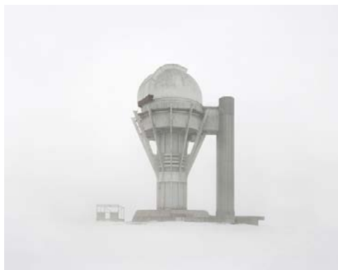
Deserted observatory. 2015 Danila Tkachenko © Courtesy of the artist and Kehrer Gallery