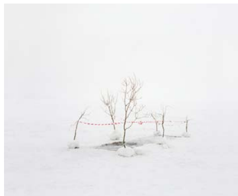
Water contamination test at the lake around the closed city Ozersk (former Chelyabinsk-40). 2013