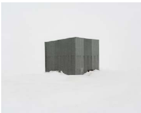
Sarcophagus over a scientific shaft which is 4 km deep. 2013 Danila Tkachenko © Courtesy of the artist and Kehrer Gallery