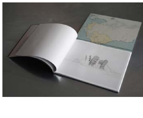
The book “Restricted areas”. Published by Kehrer Verlag 2016 Danila Tkachenko © Courtesy of the artist and Kehrer Gallery