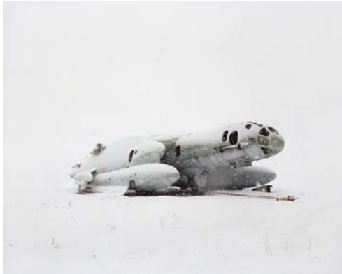
Airplane – amphibia with vertical take-off VVA14. 2013 Danila Tkachenko © Courtesy of the artist and Kehrer Gallery